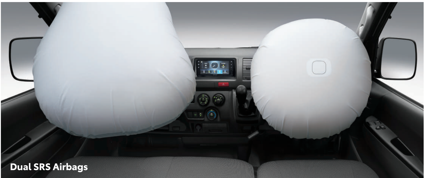
Dual SRS Airbags