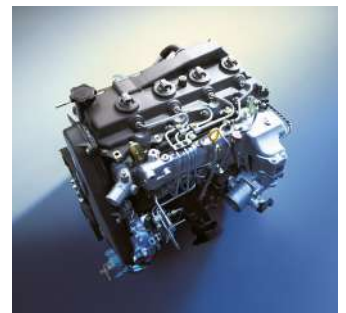
New 3.0L Turbo Diesel Engine With Intercooler